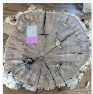
Fig. 2. Remnant of Q. stellata cross-section collected from Lake Thunderbird State Park.

The research team used FHAES computer program to analyze characteristics of the fire chronology including fire frequency (mean fire interval), fire severity (fire years in which >25% samples were scarred), and the season of fires. The team documented the fire history of the Lake Thunderbird area for the period 1806 to 1964. Fire frequency was also assessed pre-1900 and post-1900.